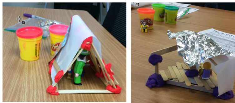
Fig. 2 Survivor MEA—physical models of water-resistant shelters